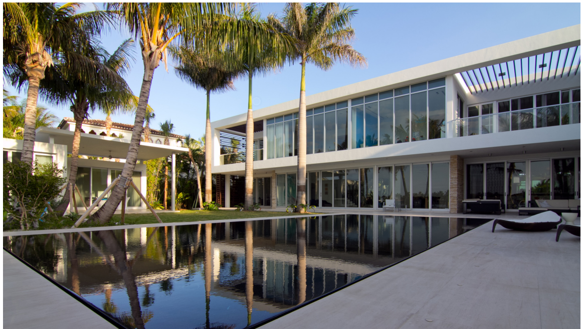
14. GUEST HOUSE 15. EXTERIOR VIEW FROM LAGOON POOL