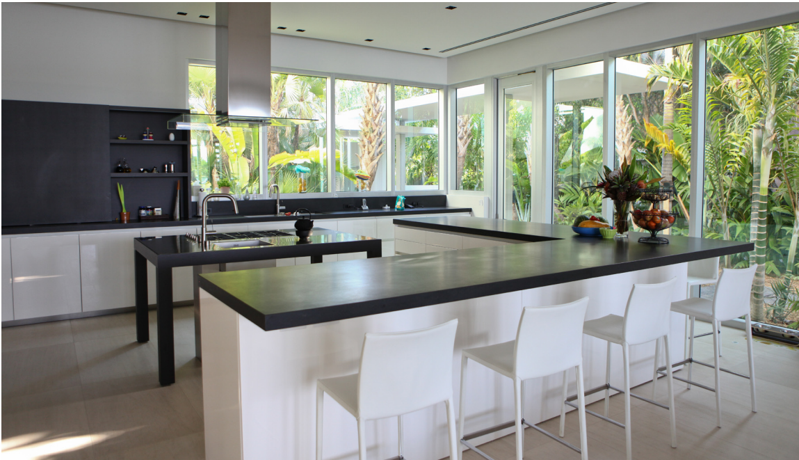
16. DINING ROOM 17. KITCHEN