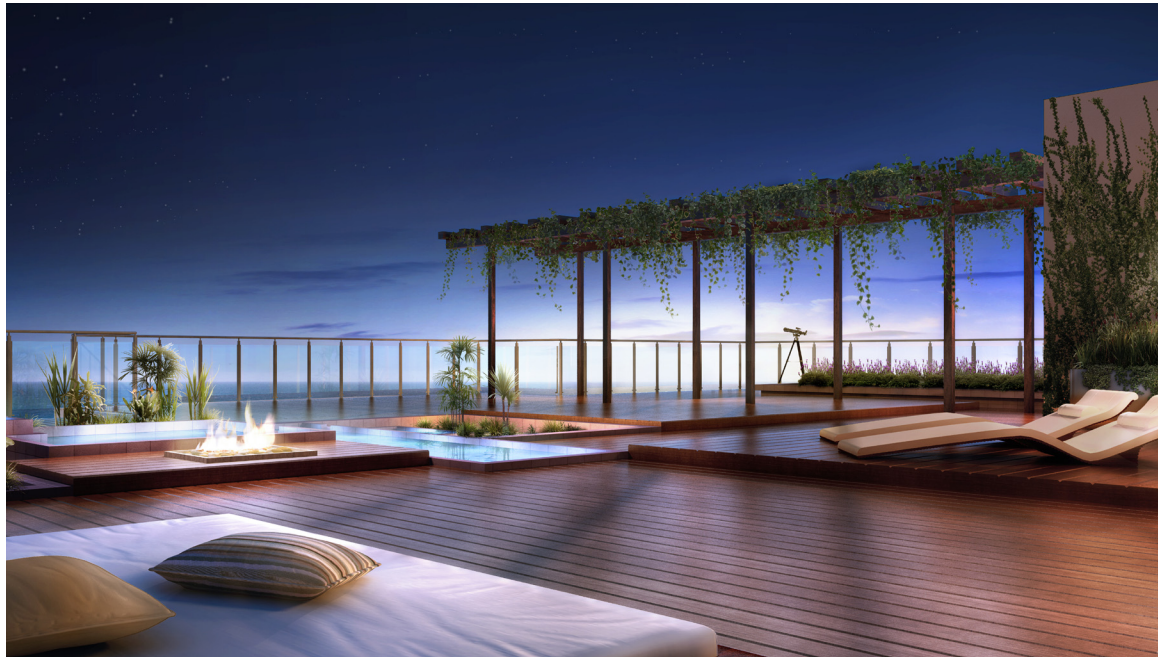
26. FAMILY ROOM 27. ROOF TERRACE & FIRE PIT